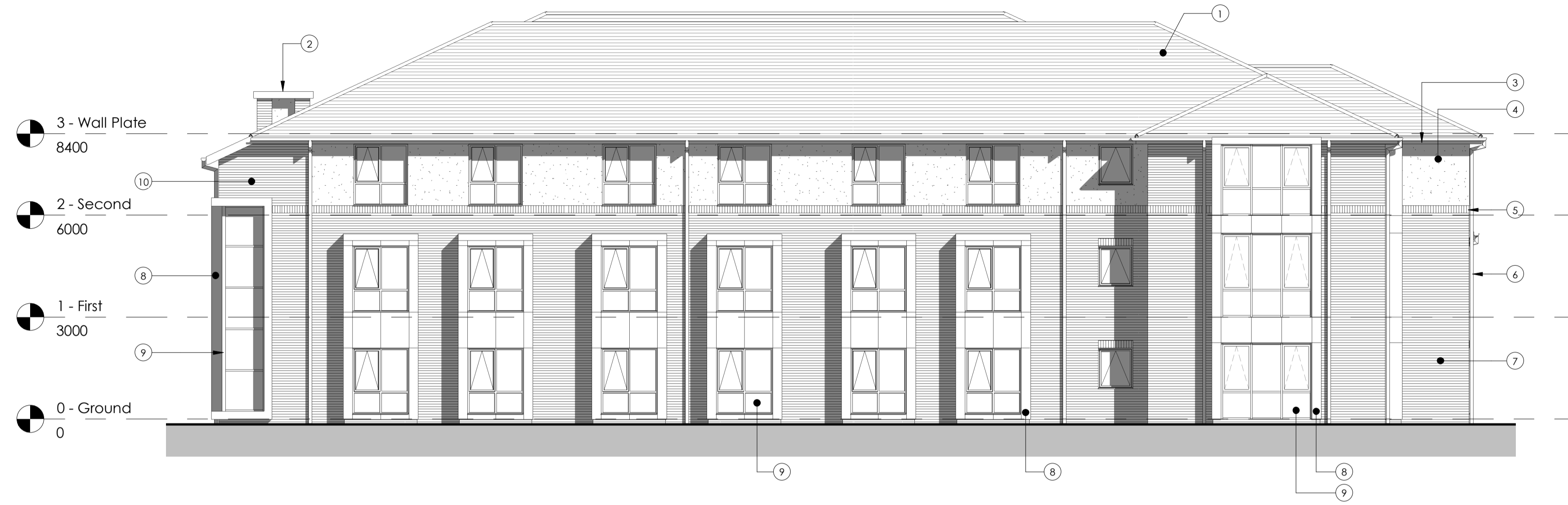
1 North 1 : 100